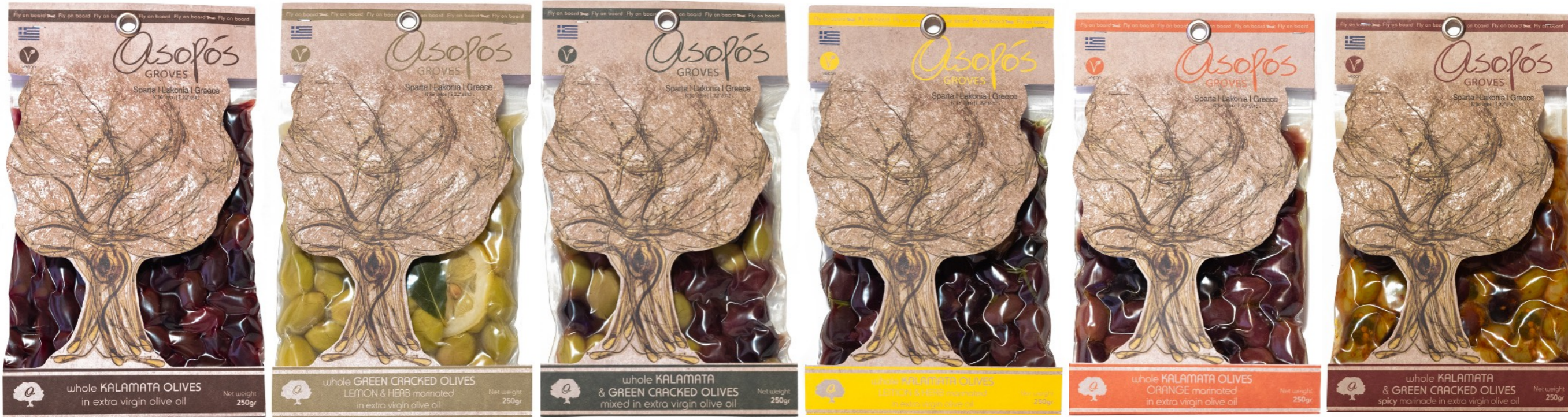
Whole Kalamata olives in extra virgin olive oil with salt and vinegar

Kalamata and Green Olives of superior quality and nutritional value without preservatives, colors and chemicals with natural fermentation > 9 months in our extra virgin olive oil . Offered in 6 different flavors with our unique packaging.